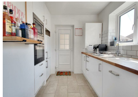
West Facing Garden